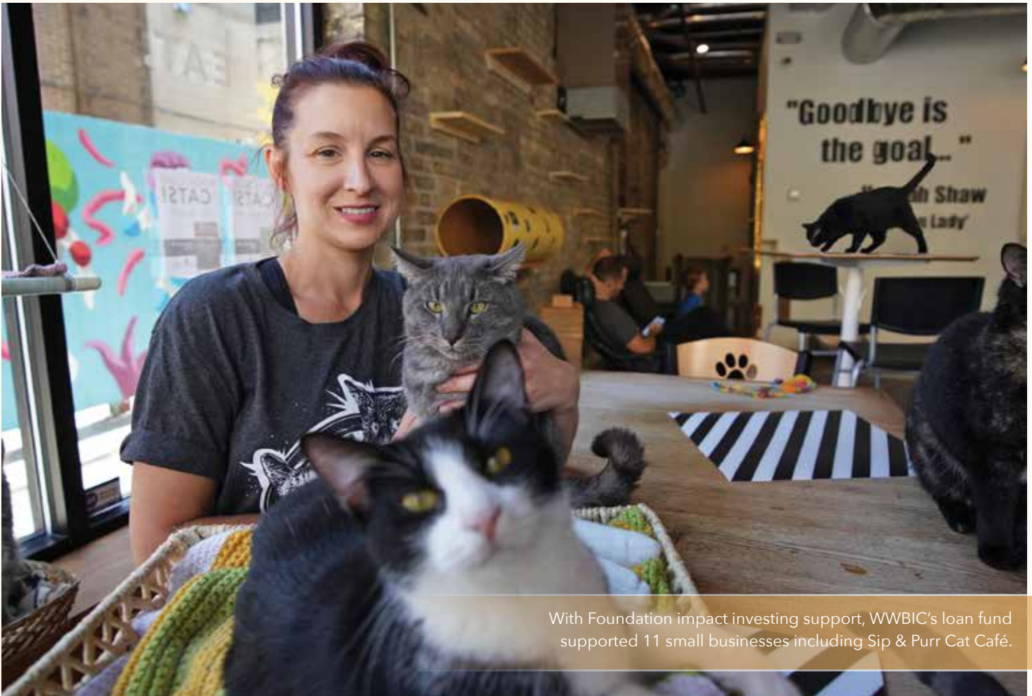
With Foundation impact investing support, WWBIC's loan fund supported 11 small businesses including Sip & Purr Cat Café.

Metro Milwaukee ranks fifth among 16 regions across the United States in its percentage of minority-owned businesses, according to Vital Signs . And the number of businesses has been on the rise since 1997.