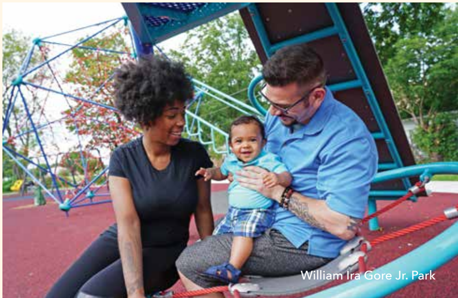
William Ira Gore Jr. Park