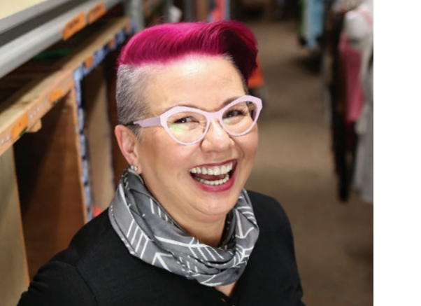
THANK YOU FOR HELPING US BUILD A MILWAUKEE FOR ALL!